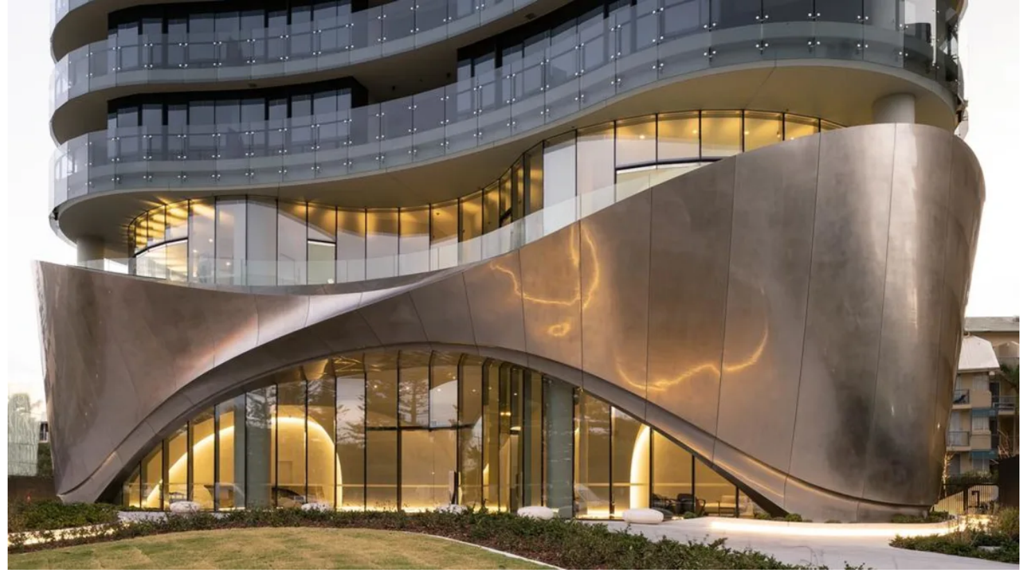
Hutchinson Builders collected the Project of the Year and Residential Building (high-rise over three storeys) over $20 million Awards for 272 Hedges Ave.

Epic Hinterland ranch crowned Gold Coast 2023 house of the year - realestate.com.au