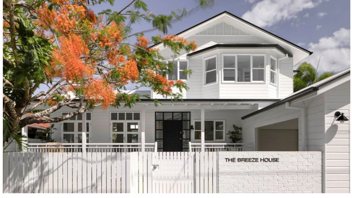
The Breeze House at Burleigh Heads earned PJH Constructions the sought-after building president's award and also saw them walk away with a win in the individual home from $1 million to $2 million category.

Epic Hinterland ranch crowned Gold Coast 2023 house of the year - realestate.com.au