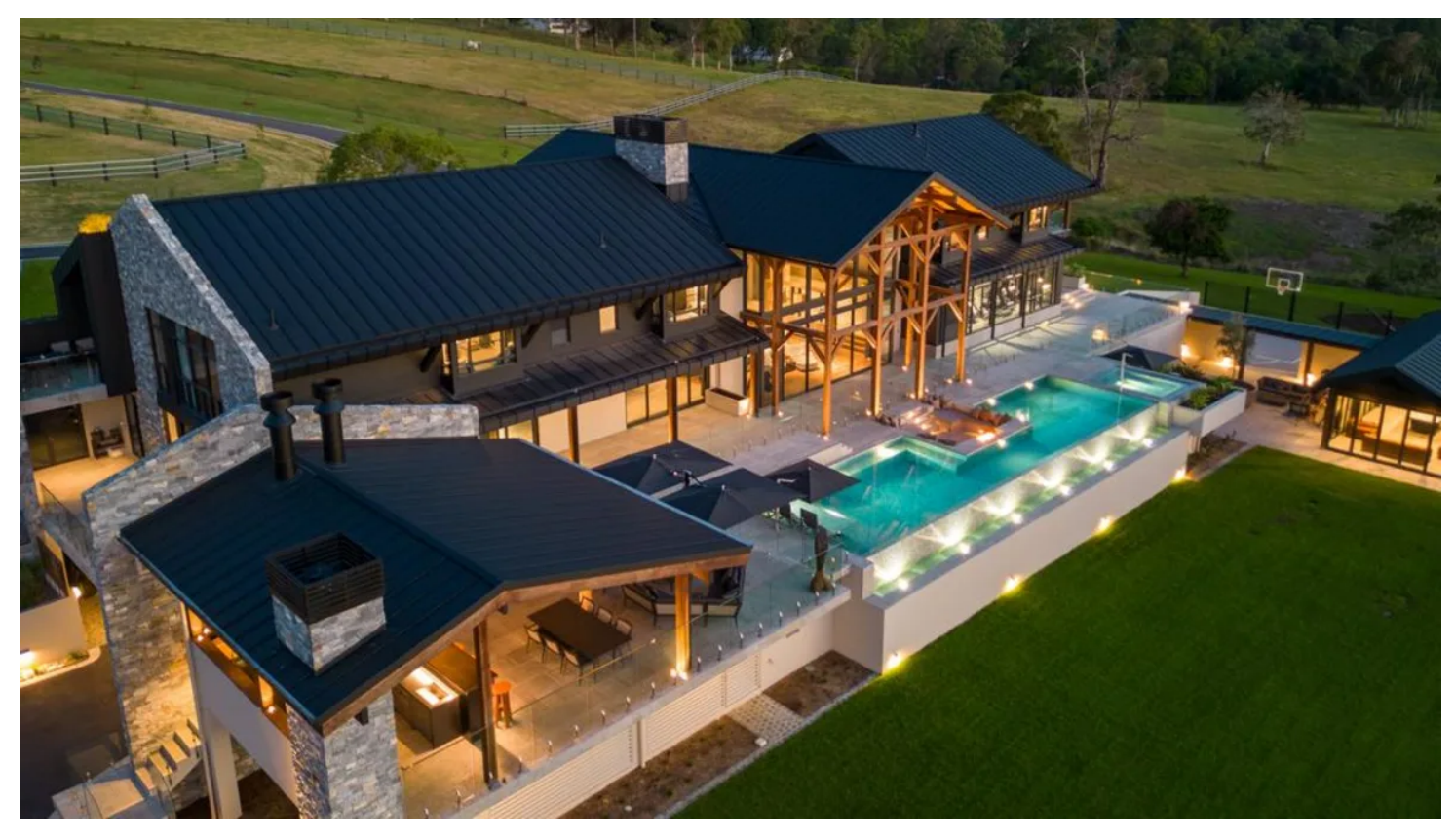
Mountainview, a spectacular equestrian homestead at Maudsland.

A SPRAWLING Hinterland ranch with horse stables, an Olympic standard arena, and a basketball court has been crowned the Gold Coast's house of the year.